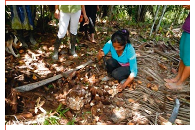
Kichwa women harvesting fruits in the so-called Purun forest.

By creating such a secondary forest particularly diverse in species, the regeneration of the forest is improved - and thus also the climatic stability of this system is much more favorable compared to other agricultural practices.