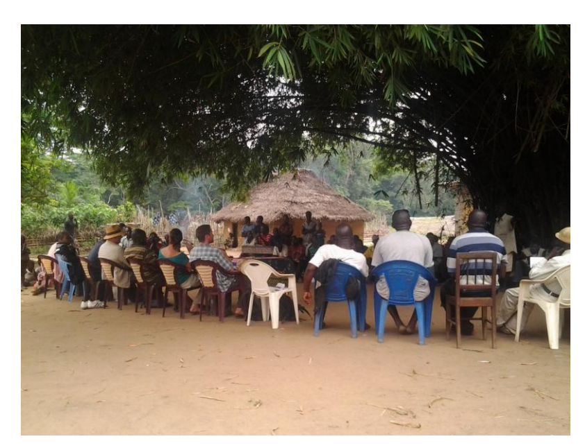
Communities addressing ERA, FPP & CEDEN during a meeting in Kesenge Village. July 2013.